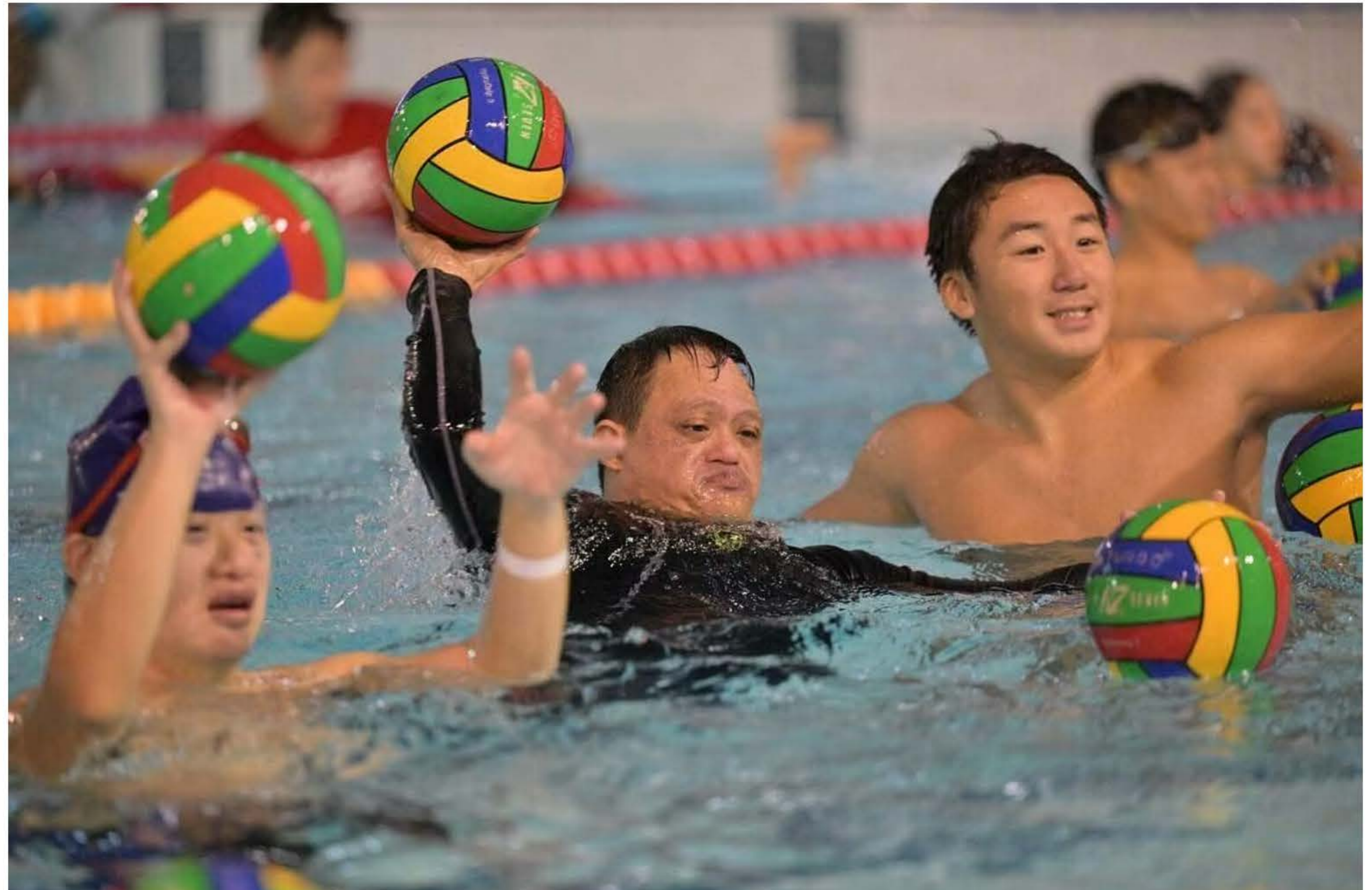
The programme features not only introductory swimming, but also niche water activities, such as diving, flippa ball and artistic swimming.

Through this event, OCBC hopes that individuals with disabilities and the underprivileged communities will gain access to these water activities and learn essential water skills.