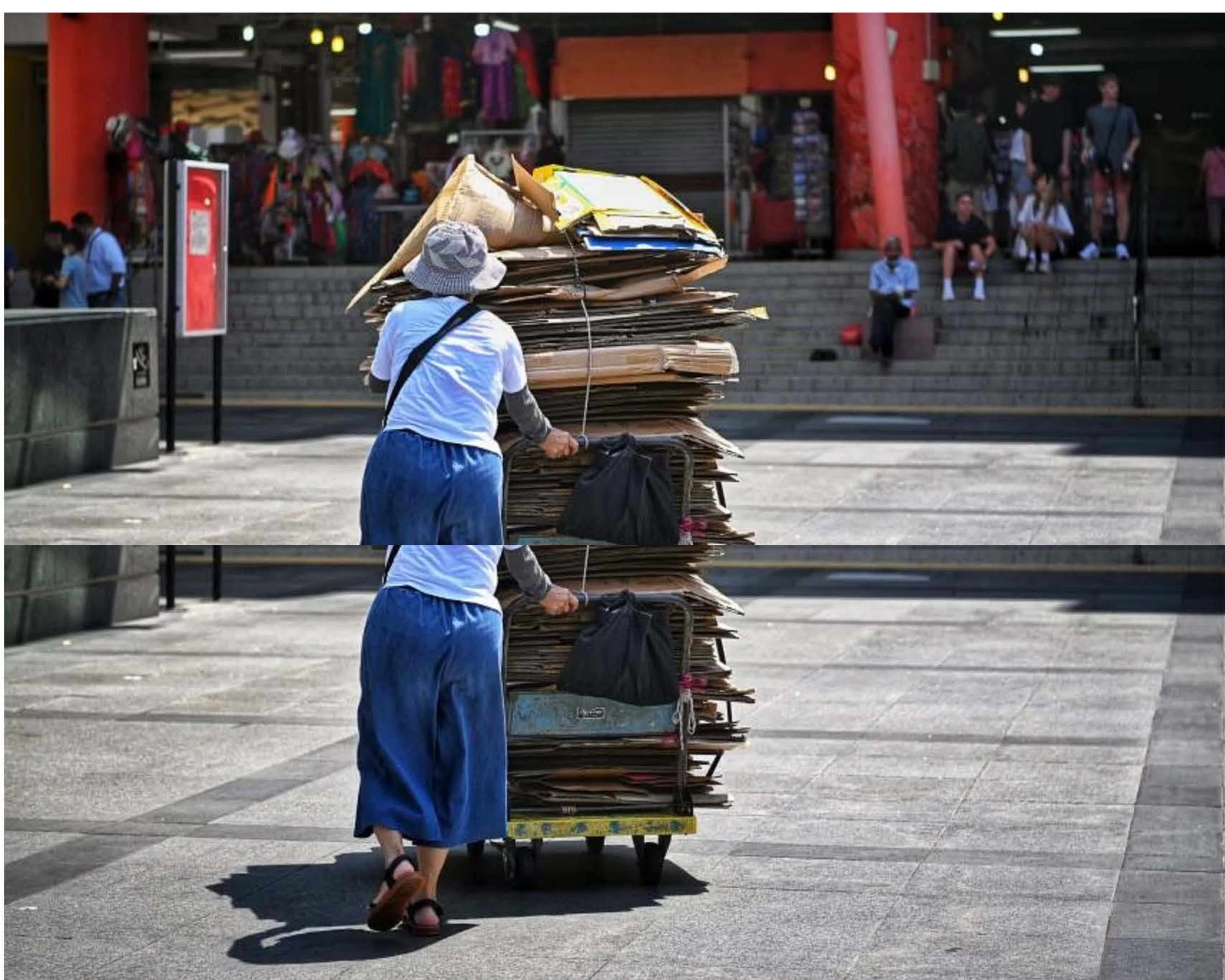
Applicants with a per capita household income of $800 or less a month will be eligible.