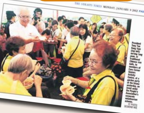
President Tony Tan Keng Yam (top left) wearing long hair, in traditional Chinese rice hair, to members of Care Corner Seniors Activity Centres at a garden party at the Istana on Monday. An event under the People's Association's corporate volunteerism scheme.