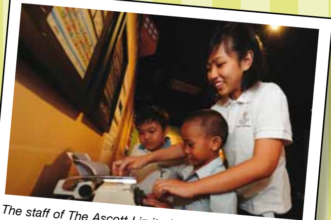
The staff of The Ascott Limited enthusiastically hosted children from Care Corner Student Care Centre (Toa Payoh) during an educational trip sponsored by the esteemed company on 14 November 2011. Places visited included the Central Fire Station, the Singapore Philatelic Museum, and the Ascott Raffles Place Singapore.