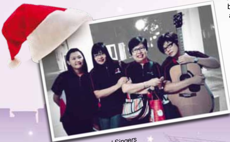
FSCAM Staff Carol Singers

For more information on Care Corner FSC (Admiralty), please Tel: 6365 8751 or email: am.fsc@carecorner.org.sg .