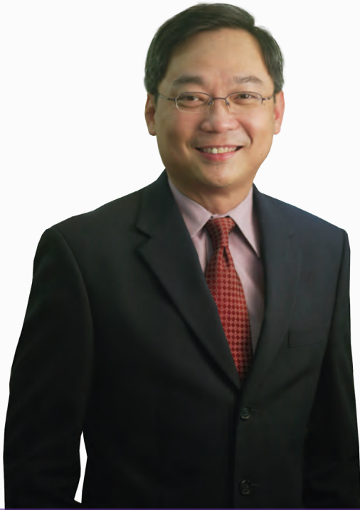
Gan Kim Yong Minister, Ministry of Health

“Care Corner has consistently delivered dedicated services through its 24 centres, not just providing direct assistance, but also in forming a bridge between needy individuals and available resources...”