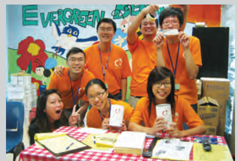
A CC-TGYC Flag Day held on Saturday, 30 October 2010 raised $78,700 in support of the Centre's outreach work.